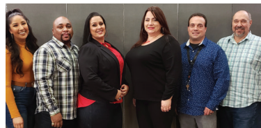
San Leandro Staff