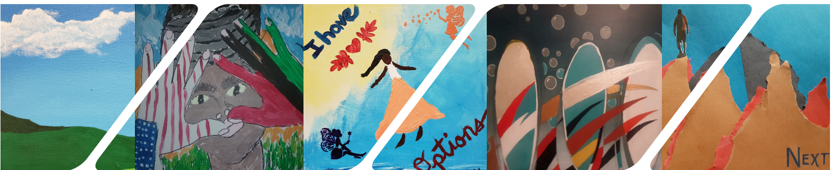
Client artwork from our 2021 Calendar