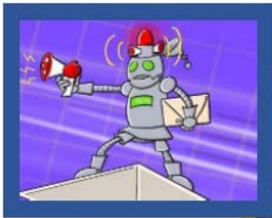
Options' Annual Calendars