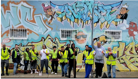
Academy of Hope participants 'Clean Up Day' in the community