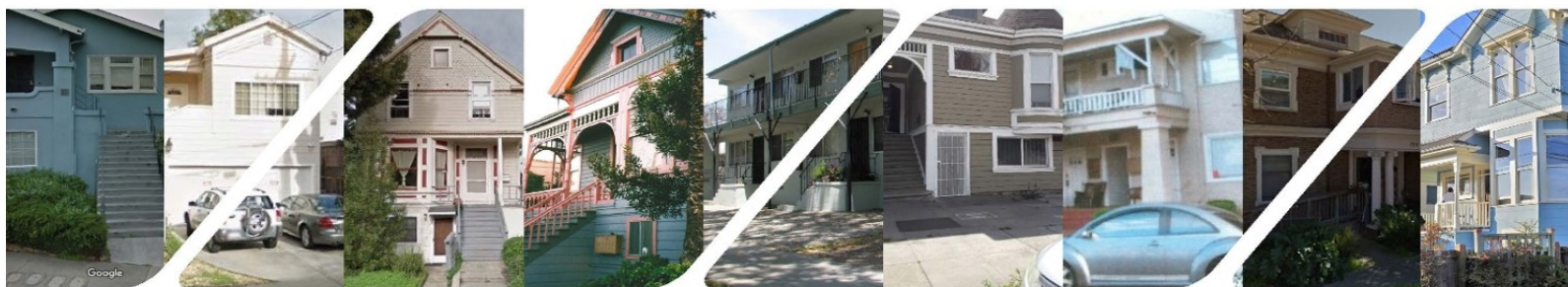
Nine Options clean and sober recovery residences.