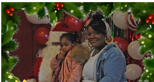
Christmas at Options

Christmas at Options Housing – Options partners with Northbrae Community Church, St. Clements Episcopal Church, St. Timothy's Episcopal Church and others to gather and present Christmas gift bags for Options' housing clients. In addition, a Christmas dinner is provided for all Options clients and staff. This year, for the first time, Options' Graduation Celebration video is scheduled to be shown at the Christmas festivities. Please see page four of this Newsletter to see how you can donate to or be a part of our Christmas celebrations.