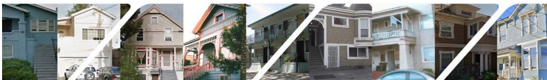
Throughout FY 2022-23, Options continued its Home Improvement Campaign, a donation drive to collect furniture for its nine recovery residences. Options partners with Northbrae Community Church, St. Clement's Episcopal Church, St. Mark's Episcopal Church, St. Timothy's Episcopal Church, and St. Patrick's Catholic Church to collect couches, dining tables, desks, dressers, lamps, and more.

Options operates nine sober recovery residences in Berkeley and Oakland, housing up to 140 clients per night primarily through public funding at little or no direct cost to the client. In FY2022-23, Options remodeled and refurbished its recovery residence in Oakland's Chinatown to house up to 12 mothers and their children in support of Options' growing perinatal recovery program.